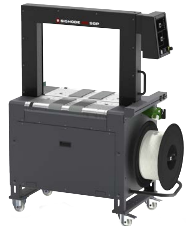
Signode SGP 3330 strapping machine paired with Signode PP Strand